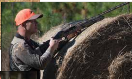
Ready... Aim... Fire!