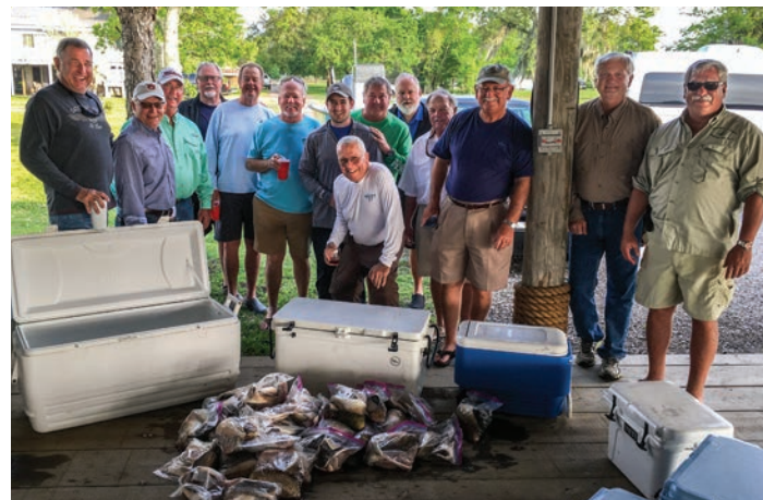
The 2019 fishing group poses for a photo with their catch at Lafitte, Louisiana. Funds raised benefitted the Delta Kappa Alpha Scholarship at PSC.