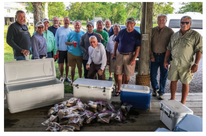
The 2019 fishing group poses for a photo with their catch at Lafitte, Louisiana. Funds raised benefitted the Delta Kappa Alpha Scholarship at PSC.